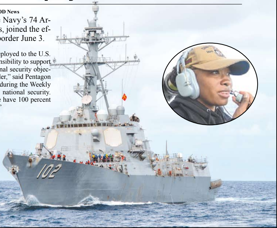
(left) In this June 3, 2024, file photo, USS Sampson prepares to receive a replenishment at sea. Sampson departed Naval Base San Diego, June 3, 2025, to support operations in the U.S. Northern Command area of responsibility.

The destroyer departed Naval Base San Diego, June 3, and is conducting operations in direct support of Northcom's mission to protect the homeland by enhancing maritime domain awareness and deterring illicit activities with U.S. interagency and law enforcement coordination.