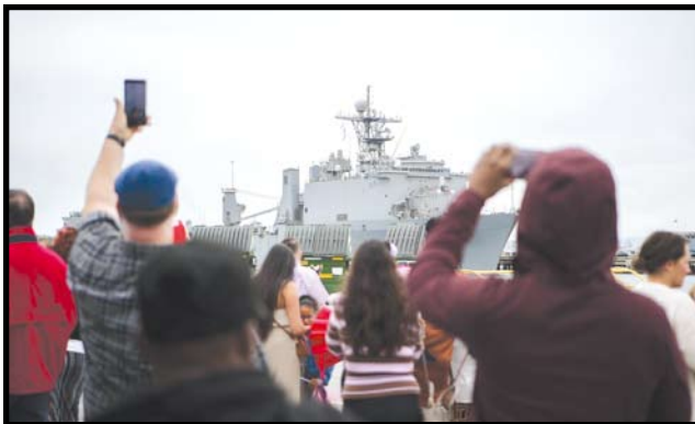
Families of Sailors aboard Comstock anticipate the ship’s arrival at Naval Base San Diego.