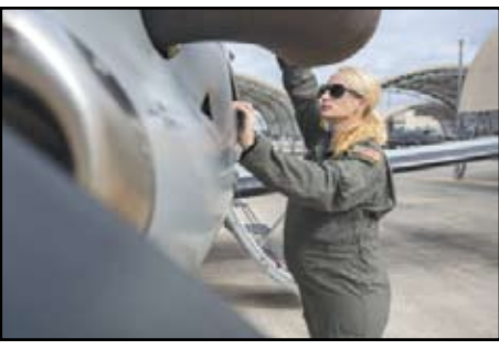
pregnant Airman conducts preflight inspections Oct. 25, 2022, at Hurlburt Field, Fla.

waiver authority for allowing those members to fly during that period is now at the major command level, however, ensuring a