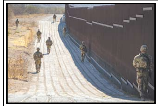
SQUAD PATROL Soldiers conduct a dismounted squad patrol along the southern border near Sierra Blanca, Texas, March 31, 2025.

The task force will produce a final report on DOD's actions to terminate any DEI initiatives no later than June 1, 2025.