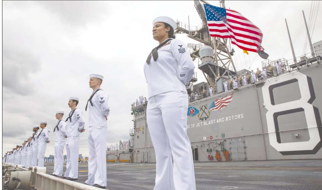
Sailors aboard amphibious assault ship USS Makin Island (LHD 8) man the rails as the ship returns to Naval Base San Diego following a seven-month deployment to the Indo-Pacific region, June 8, 2023. The Makin Island Amphibious Ready Group , comprised of Makin Island and amphibious transport docks USS Anchorage (LPD 23) and USS John P. Murtha (LPD 26) , with the embarked 13th Marine Expeditionary Unit, participated in multiple training exercises with international partners while deployed in support of regional stability and a free and open Indo-Pacific.

SIXTY-THIRD YEAR NO. 4 THURSDAY, JUNE 15, 2023