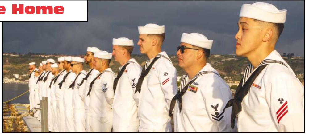
Sailors man the rails as amphibious transport dock USS Anchorage (LPD 23) returns to Naval Base San Diego following a seven-month deployment to the Indo-Pacific region, June 8, 2023.