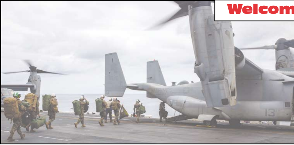
Marines assigned to 13th Marine Expeditionary Unit (MEU) prepare to depart amphibious assault ship USS Makin Island (LHD 8), June 6, 2023. Working with the Makin Island Amphibious Ready Group (ARG), the 13th MEU is the United States' most forward-postured presence, conducting missions across the full spectrum of military operations and serves as ready-response force for any type of contingency. The Makin Island ARG, comprised of Makin Island and amphibious transport docks USS Anchorage (LPD 23) and USS John P. Murtha (LPD 26), returned home with the embarked 13th MEU.