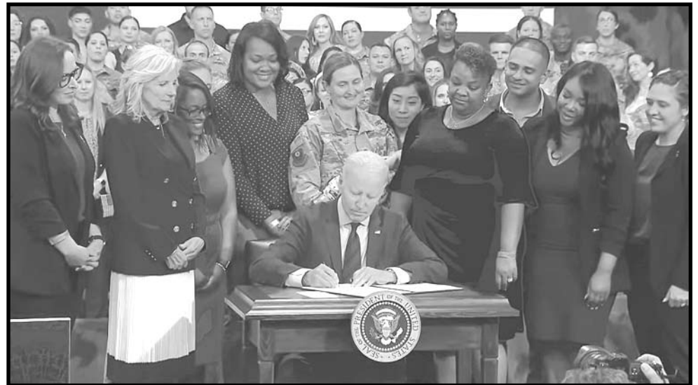
President Joe Biden signs an executive order at Fort Liberty, N.C., June 9. The executive order is designed to strengthen economic opportunities for military and veteran spouses, caregivers and survivors.

While the executive order will help many military and veteran spouses, caregivers and survivors find more meaningful work, it won’t solve every problem, she acknowledged. She called on the private sector to also pitch in to augment what was done by the executive order.