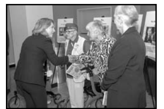
Deputy Defense Secretary Kathleen H. Hicks exchanges greetings at a June 12 ceremony commemorating the 75th anniversary of the Women’s Armed Services Integration Act of 1948.

Even more, Austin said, the military must be accommodating of women in service - and there’s more work to be done, including the elimination of bias, sexual harassment and sexual assault. He said military service must be made compatible with raising a family - for mothers and fathers. All those things, he said, are priorities for DoD.