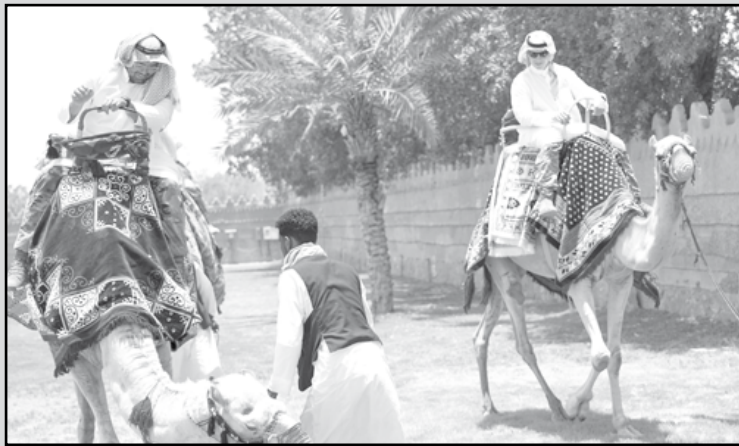
PRINCE SULTAN AIR BASE, SAUDI ARABIA (June 6, 2023) Service members ride camels during Saudi Cultural Days. The event is a gesture of hospitality on behalf of the Royal Saudi Air Force to showcase local culture to U.S. service members.