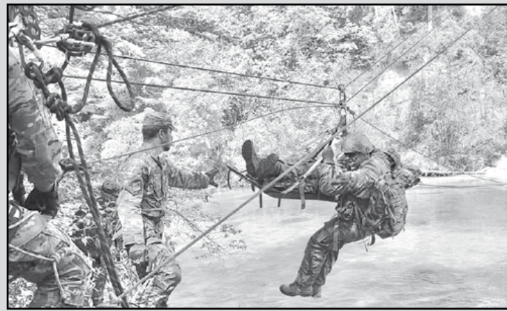
BOHINJSKA BELA, SLOVENIA (May 25, 2023) Colorado Army National Guard members work alongside their NATO partners to showcase their abilities to distinguished visitors during DEFENDER 23.