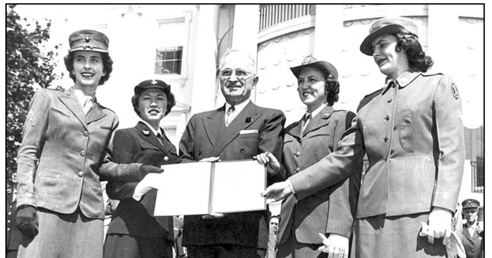
President Harry S. Truman stands in front of the White House and holds a copy of the Women’s Armed Services Integration Act, which created regular and reserve status for women in the military, June 12, 1948.

The group also recommended the Pentagon work with elected officials, the Department of Veterans Affairs and veterans services organizations “to implement a public health informed strategy to address extremism in the ranks.”