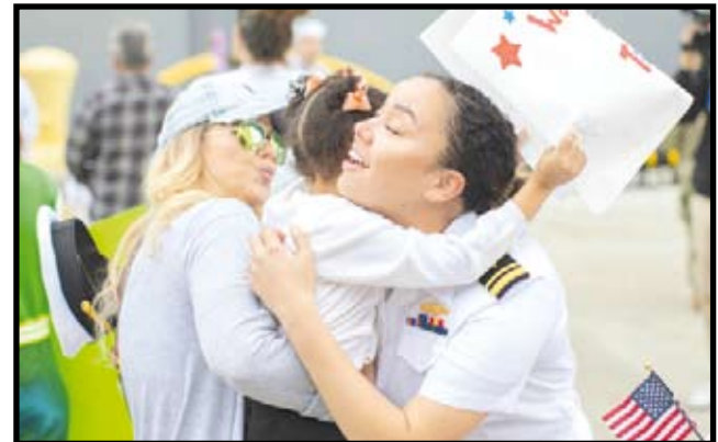
A Sailor aboard amphibious assault ship John P. Murtha gives a warm hug to a family member after the ship returned to San Diego following a seven-month deployment.