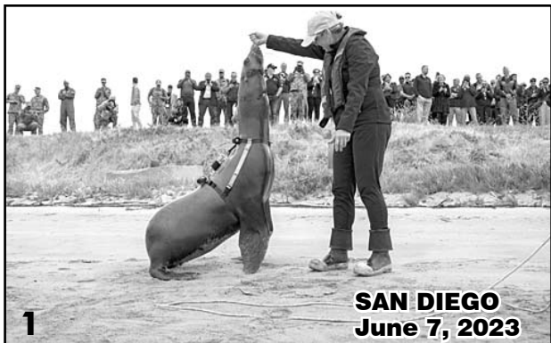
SAN DIEGO June 7, 2023