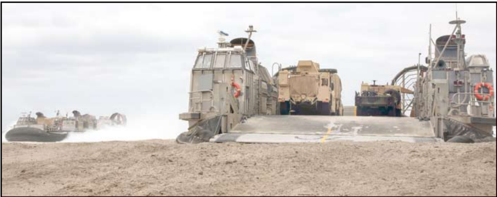
Landing craft, air cushion (LCAC) assigned to Assault Craft Unit (ACU) 5, embarked aboard amphibious assault ship USS Makin Island , arrive at Camp Pendleton, June 6, 2023. The amphibious capability of the Navy and Marine Corps team has been demonstrated in a broad range of operations including foreign humanitarian assistance operations, noncombatant emergency evacuations, natural disaster response, the recovery of downed aircraft and personnel, counter-piracy and strike operations, and diverse support to our partner nations. The Makin Island Amphibious Ready Group, comprised of Makin Island and amphibious transport docks USS Anchorage (LPD 23) and USS John P. Murtha (LPD 26), returned home with the embarked 13th Marine Expeditionary Unit.