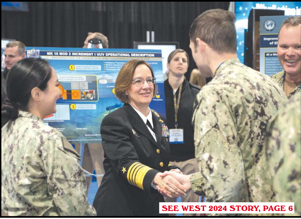
SEE WEST 2024 STORY, PAGE 6

SAN DIEGO (Feb. 13, 2024) Chief of Naval Operations Adm. Lisa Franchetti meets with Sailors assigned to the Naval Meteorology and Oceanography Command during a walkthrough of the Navy Information Warfare Pavilion at WEST 2024. WEST enters its 34th year bringing military and industry leaders together to network, discuss, and demonstrate design and technology solutions.