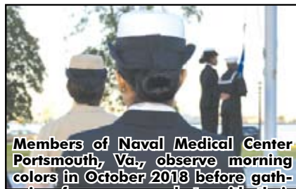
Members of Naval Medical Center Portsmouth, Va., observe morning colors in October 2018 before gathering for a group photo with their combination or “bucket” covers.

“The intent of this policy update is to address expressed dissatisfaction regarding the required wear of male or unisex