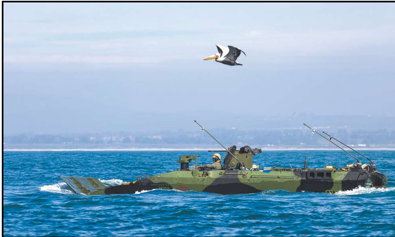
BIRD WATCH | U.S. Marines with 3rd Assault Amphibian Battalion, 1st Marine Division, operate amphibious combat vehicles during launch and recovery drills off the coast of Camp Pendleton in late January. The sustainment drills allowed the Marines to increase their proficiency in amphibious maneuvering by practicing launch and recovery procedures.

SIXTY-THIRD YEAR NO. 39 MARCH 1-15, 2024