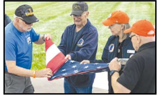
SAN DIEGO (April 6, 2024) Volunteers fold U.S. flags to honor fallen Naval Special Warfare comrades at Miramar National Cemetery. Naval Special Warfare is the nation's premiere maritime special operations force.