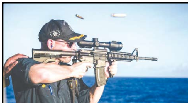
The Navy removed a post on its official Instagram account Wednesday, April 10, 2024, showing a warship commander firing a rifle with a backward scope.

"Thank you for pointing out our rifle scope error in the previous post," the Navy later wrote on various social media accounts. "Picture has been removed until EMI [extra military] see Photo, page 3