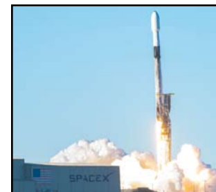
Space Force mission carrying the first Weather System Follow-on Microwave satellite launches from Vandenberg SFB April 11.