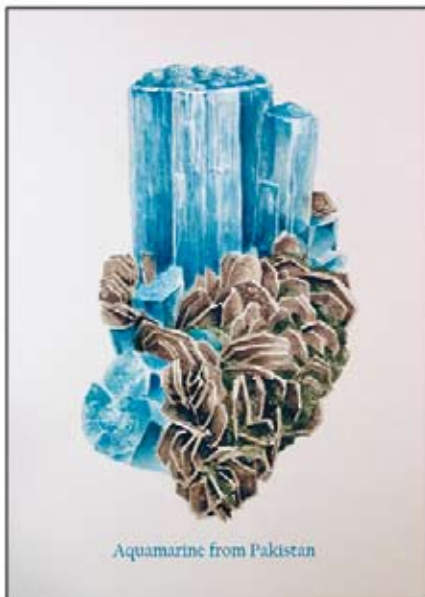
Aquamarine from Pakistan